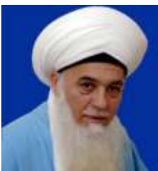
Shaykh Hisham Kabbani (USA)

SimplyIslam regularly invites and hosts outstanding international Islamic scholars as part of its public education programs in Singapore and the region. The following are among the scholars: