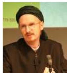
Shaykh Abdal Hakim Murad (UK)