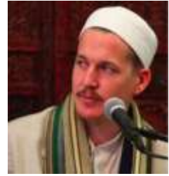
Shaykh Yahya Rhodus (USA)