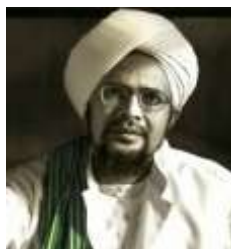
Habib Umar Bin Hafiz (Yemen)