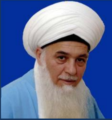
Shaykh Hisham Kabbani (USA)

SimplyIslam regularly invites and hosts outstanding international Islamic scholars as part of its public education programs in Singapore and the region. The following are among the scholars: