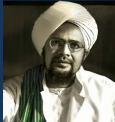
Habib Umar Bin Hafiz (Yemen)