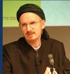
Shaykh Abdal Hakim Murad (UK)